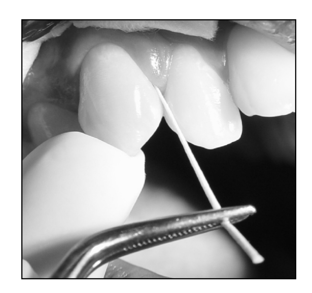
FIGURE 1. GCF sampling

The eppendorf tube containing 3 dipped paper points per site was centrifuged using the centrifuge machine (MicroCentaur, UK) for 5 min at 2000 g in order to elute completely GCF components. The paper points were removed and the supernatant stored at -40^{\circ} C until analysed for a maximum of 1 week.